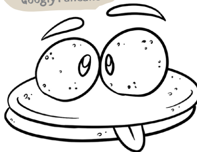
Pandekage Kigger Googly Pancake

Pandekager DKK 75,- Med vaniljeis og frugt. Pancakes With vanilla ice cream and fruit.