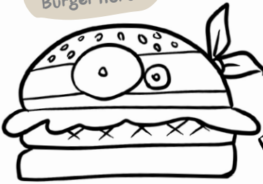
Burger Helt Burger Hero

Børneburger DKK 95,- Byg selv med hjemmebagt burgerbolle, bøf, salat, tomat, agurk og pommes frites. Kids' burger Build-your-own burger with a homemade bun, beef patty, lettuce, tomato, cucumber and fries.