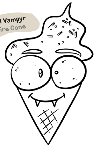
Vaffel Vampyr Vampire Cone

Isvaffel DKK 60,- Med vaniljeis, jordbær, flødeskum og knas. Ice cream cone With vanilla ice cream, strawberry ice cream, whipped cream and crunchy topping.