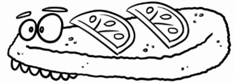
Dino Filet Dino Fillet

Stegt pankopaneret fiskefilet DKK 95,- Med pommes frites, citron og grov remoulade. Fried panko-cruste fillet of fish With fries, lemon and chunky remoulade.